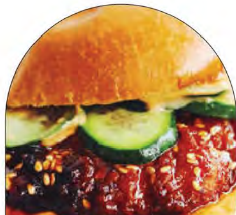
Loaded Greek Fries

Pulled Korean BBQ Pork + Cucumber Salad + 3 Steamed Buns