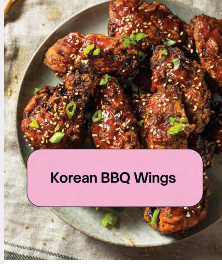
Korean BBQ Wings