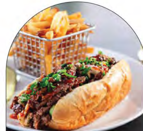
Korean BBQ Hero

Fried Chicken Toasted in Korean BBQ Sauce + Cucumber Salad + Brioche Bun