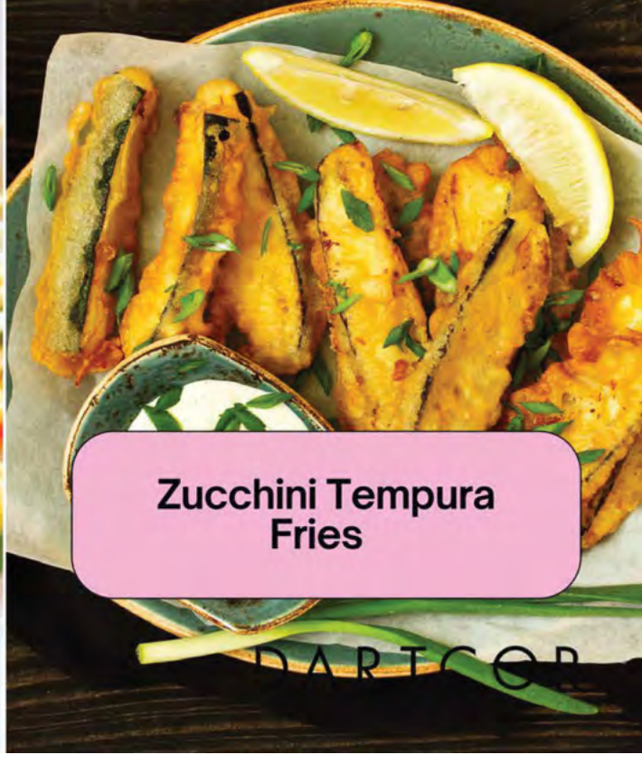
Zucchini Tempura Fries