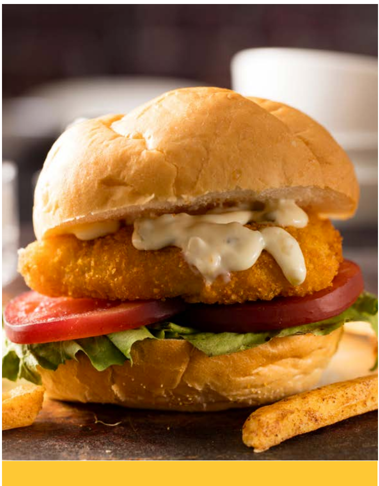
Fried Catfish Sandwich