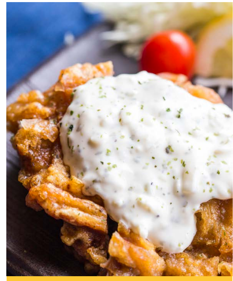
Chicken Fried Steak w. Whipped Potatoes