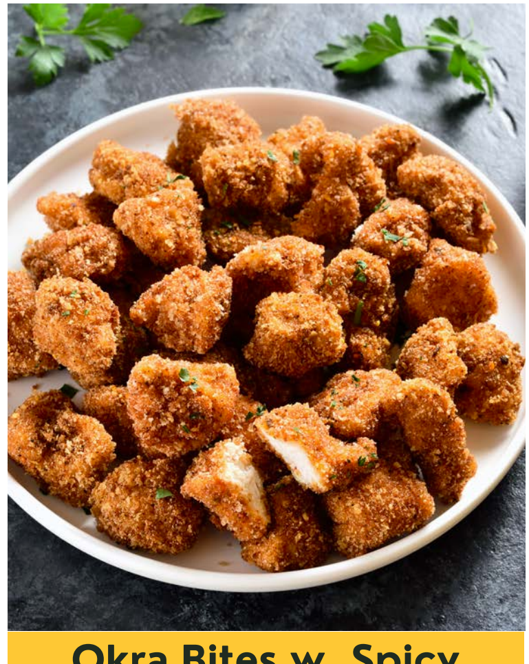
Okra Bites w. Spicy Dipping Sauce